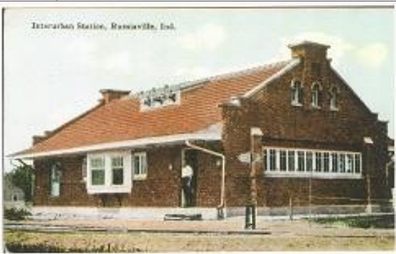
Building as it appeared when new—circa 1912.