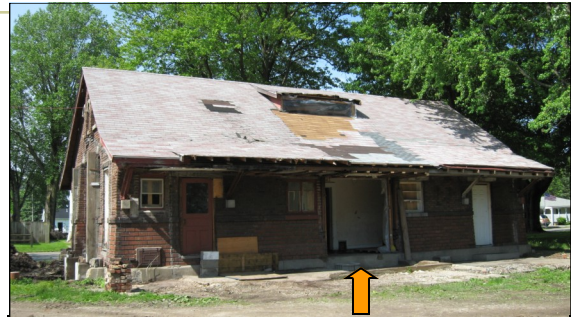
South side opening where window originally sat.

We will be applying for a $500,000.00 grant from INDOT to cover exterior preservation and interior rehabilitation. The application is due in October and we'll know in February 2012 if we are awarded the grant. This grant requires a 20% match from local or other funds.